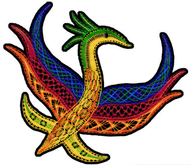
DESIGN & LACE BY LOUISE COLGAN